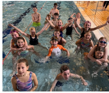
Our successful swimmers!