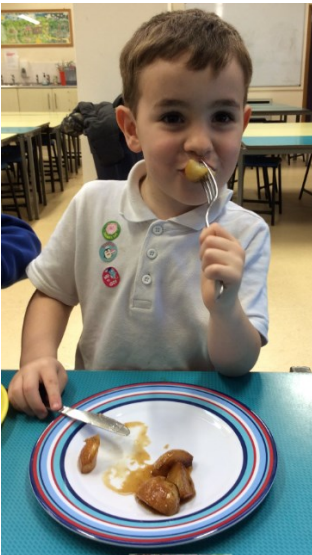
Cooking Club made chocolate crepes and caramelised pears.